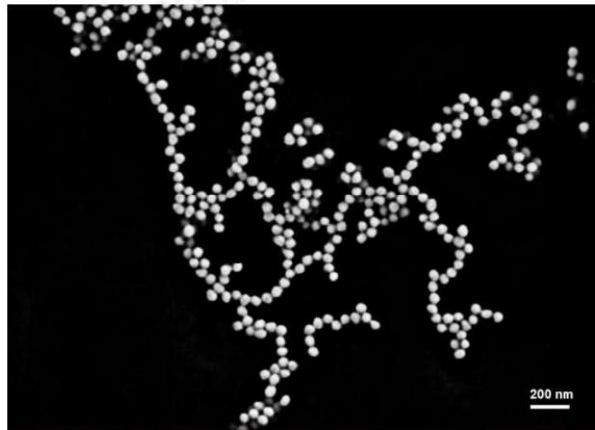
SEM image of Au Nanoparticles (50nm)